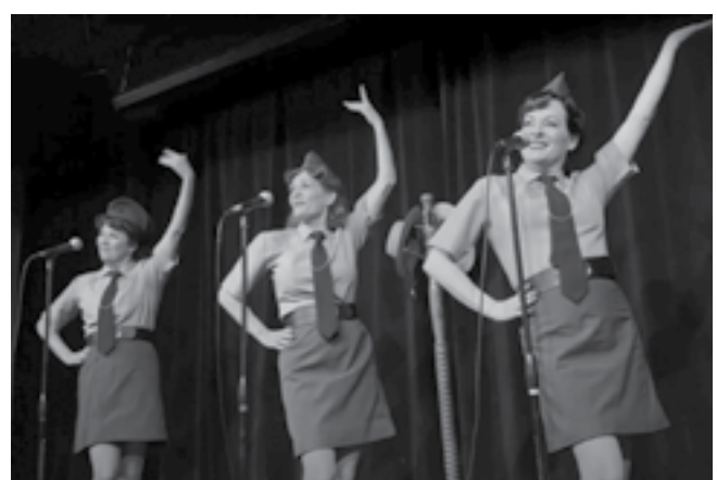
The Lindy Sisters tribute to the Andrews Sisters