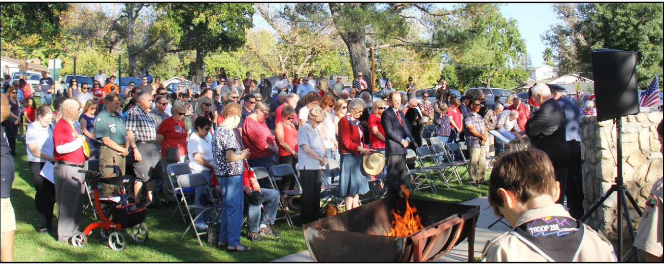
Veterans and the community showed up to show their respect AT 2 Strike Park.

Please see Parson's Trail Possum Massacre on Page 8