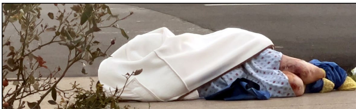
We don't treat animals this way – why should we treat humans like this?

Realistically, we put it in the hands of our doctors that we find to prescribe medication accordingly and, on the individual, to take the medication as prescribed on their own. However, when it comes to the houseless population who have less money, less opportunity, less resources, and less quality insurance plans, what is the solution? The solution is that there is none, which is what you see on the streets of Skid Row along with every other houseless and mentally ill individual. As a society, we face the repercussions of the